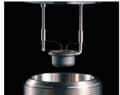
Combustion vessel design makes pre-/post-handling of samples trouble-free.

The AC500 achieves high precision across a wide range of sample sizes and ambient conditions. Results may be obtained using a choice of three modes: the traditional Regnault-Pfaundler = 20 minutes, Precision = 8 minutes, or Predictive = 4.5 to 7.5 minutes.